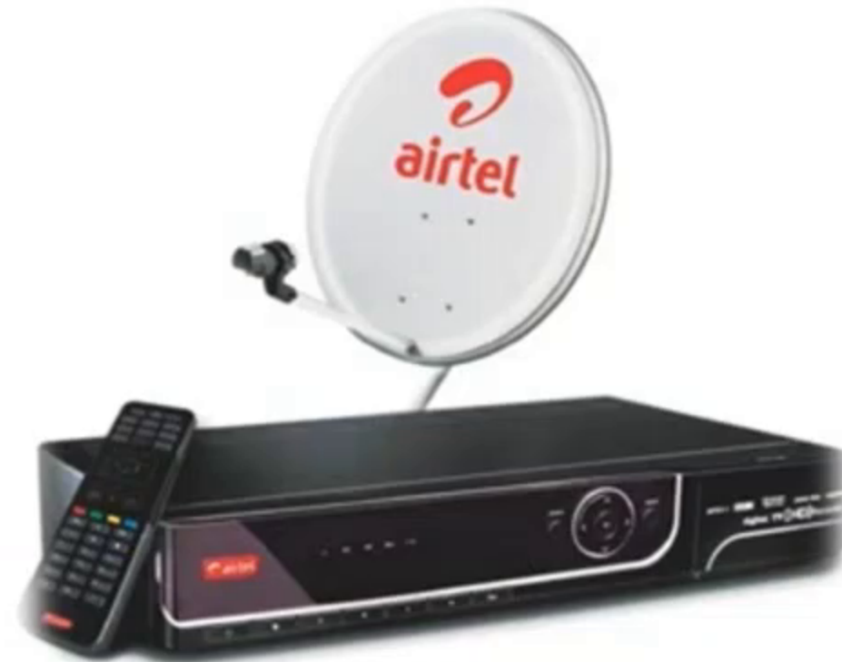
Airtel Set of Box